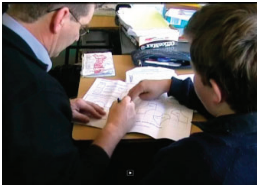
Figure 2. Using geometry to teach algebra

to the students. Teachers placed a great deal of emphasis on the patterns found when calculating with rational numbers and with rational expressions, including during topics such as geometry. Furthermore, the algebraic skills taught were used throughout the year in a variety of contexts and reinforced through regular maintenance.