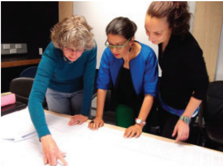
Figure 1. Teachers examining assessment data.

We considered that it was essential to know where the students were at so that we could make decisions about next learning steps, especially as students came from a number of contributing schools and therefore had widely differing prior experiences. At the workshops, a great deal of time was spent poring over diagnostic assessment information. The purpose was to document the most sophisticated strategies that a student could use and to identify their prerequisite knowledge, not to generate a score. There was considerable discussion about the arithmetic skills and knowledge that many high school teachers might assume that their students would have learnt at primary school. Consistent with the findings of Warren (2003), the diagnostic assessment revealed that many students did not have a good understanding of arithmetic structure, inverse operations or equivalence. Students’ knowledge of algebraic notation and conventions and acceptance of lack of closure were also documented, as well as their strategies for solving equations, expressing generality and finding relationships between variables. Teachers’ approaches with their classes and interventions with individual students throughout the project were guided by the detailed knowledge they had acquired.